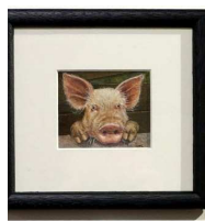
A few of the other winners